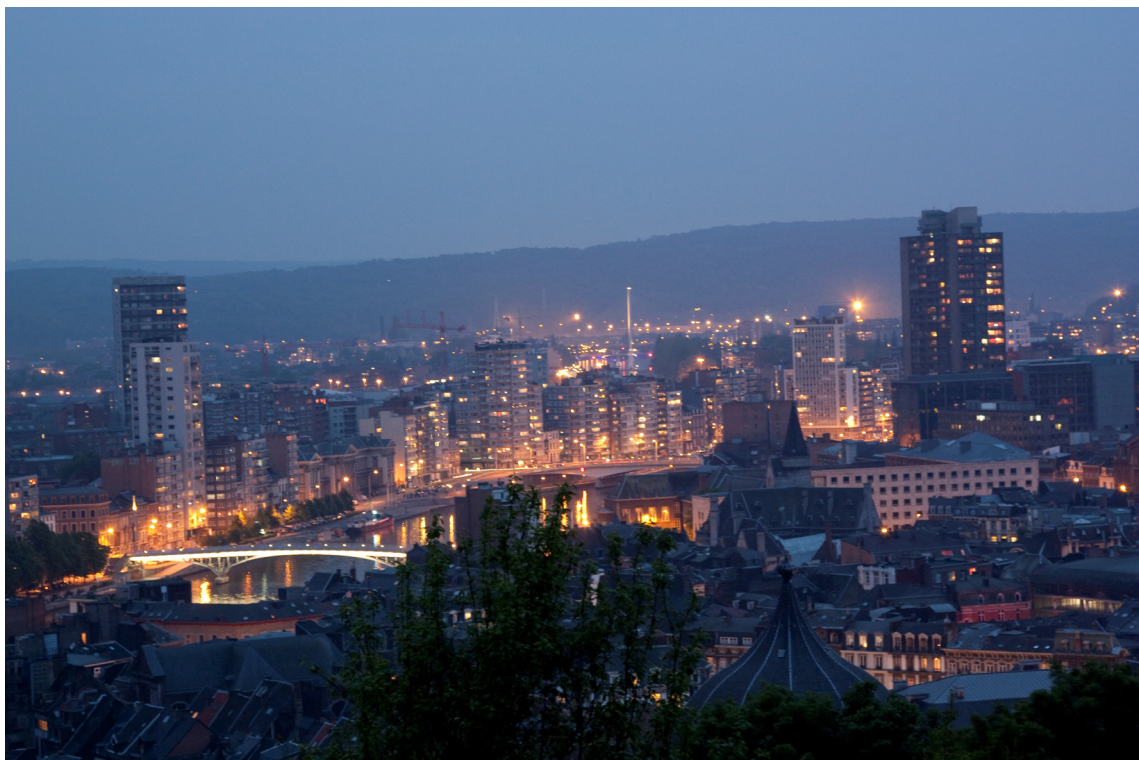
Liège by night