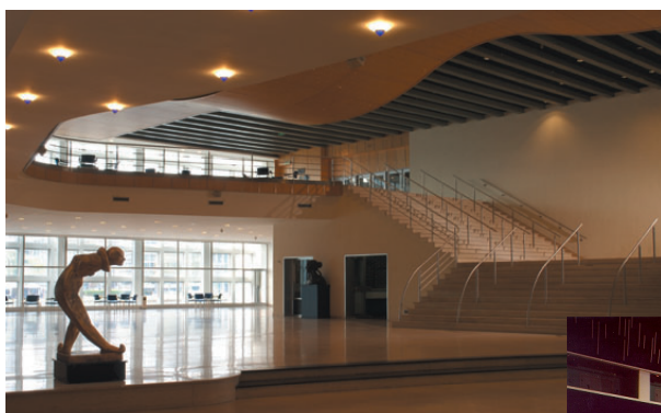
Grand Hall

The conference is listed under the “Meetings and Conferences” section of numerous professional societies’ websites of major Photobiology Societies, the Royal Society of Chemistry, the American Society of Chemistry, the European Platform for Photodynamic Medicine, Oncology and Dermatology Societies, the Society of Porphyrins and Phthalocyanines, and the International Photodynamic Association, to name just a few, as well as on commercial websites.