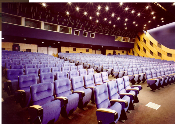
Queen Elisabeth Hall