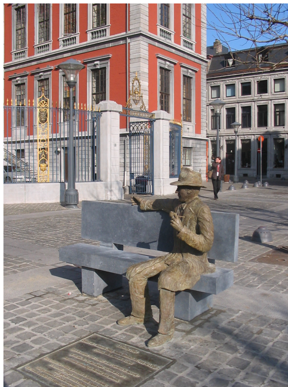
Banc Simenon, Liège