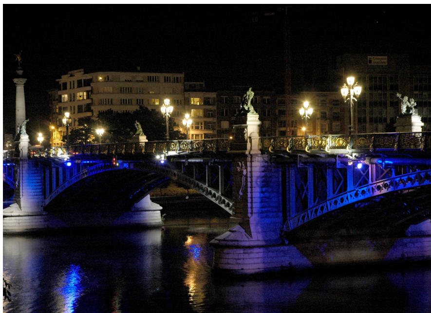
Pont de Fragnée, Liège